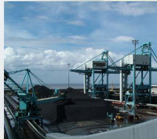
Liverpool Bulk Terminal

In 1994 Norec was awarded the materials handling contract for the Flue Gas Desulphurisation (FGD) Plant at Ratcliffe Power Station, Nottingham on behalf of Powergen plc. A year later, the contract to manage, operate and maintain the fuel and secondary products areas followed – a contract that is still held today.