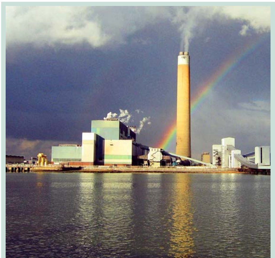
Rainbow over Kingsnorth. See our Norec special feature on pages 4 & 5.

The changes in our business over the last twelve months have impacted on us all as we go about our daily tasks. On behalf of the Hargreaves Board and management